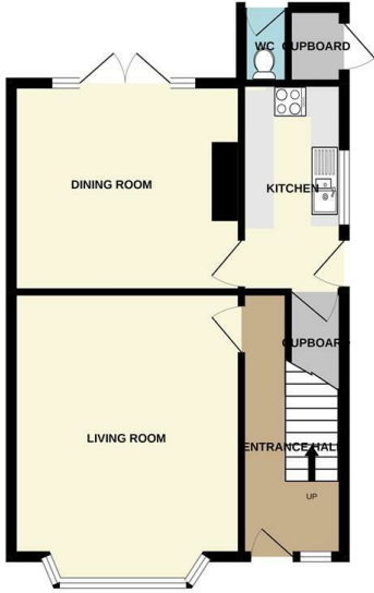
GROUND FLOOR 494 sq.ft. (45.9 sq.m.) approx.